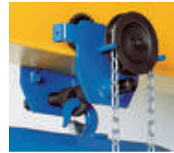
Geared trolley 1 to 20 t