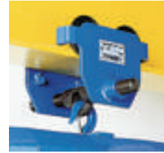
Push trolley ½ to 10 t