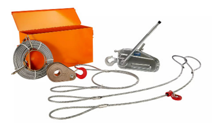
Griphoist® tirfor® rescue kit shown